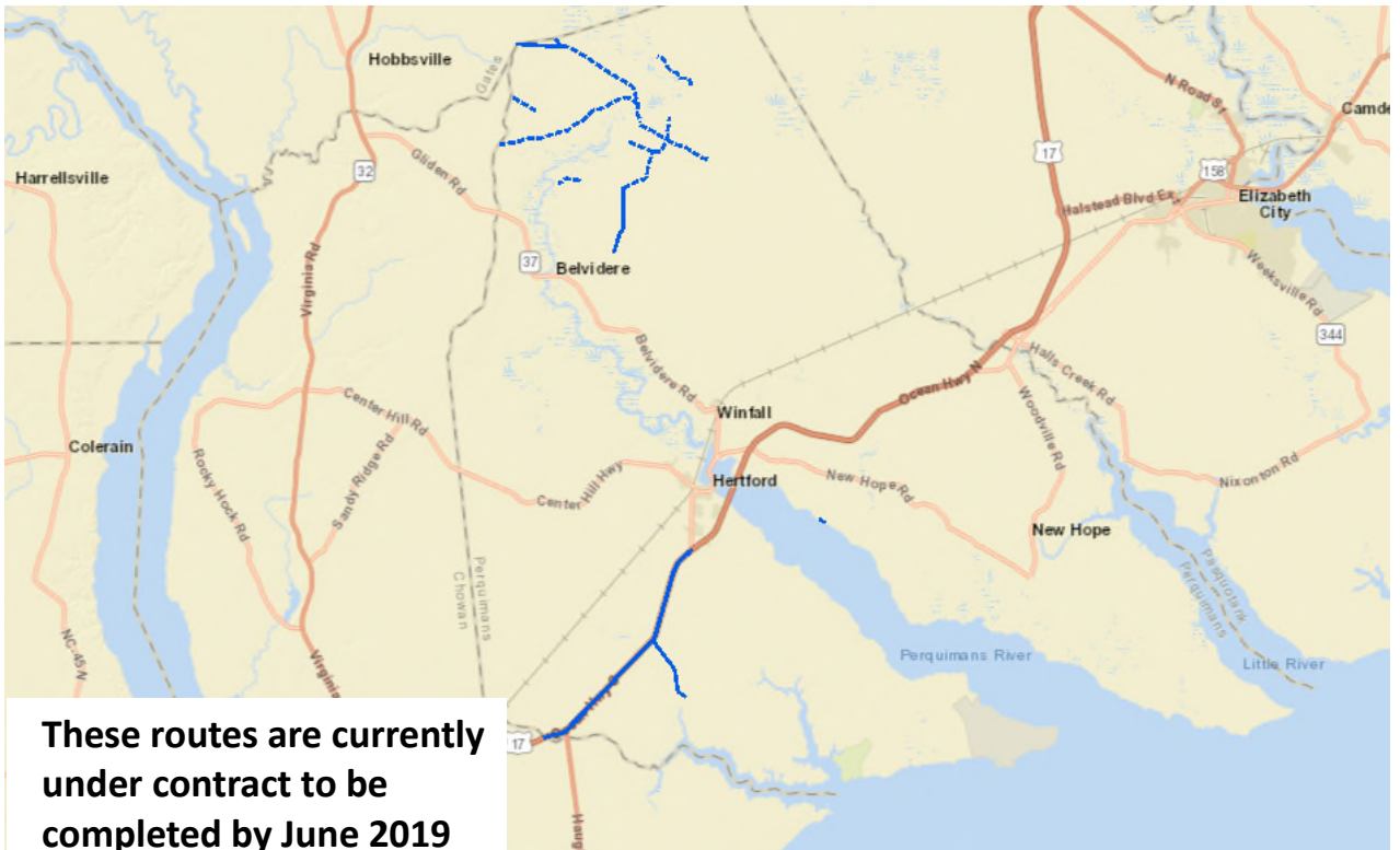
These routes are currently under contract to be completed by June 2019